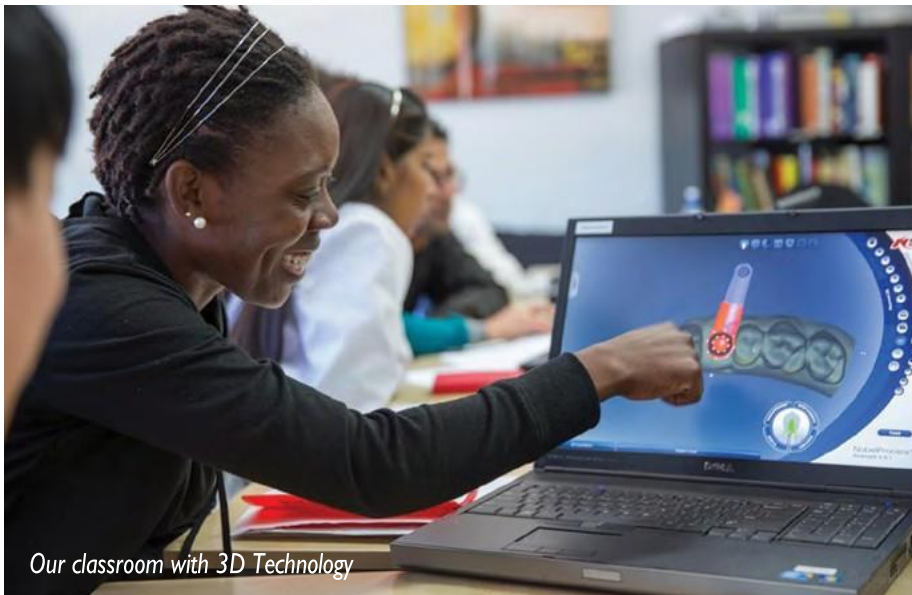
Our classroom with 3D Technology

College situated between Perth and the airport - 5 minutes from the city with good accommodation, transport and free parking available.